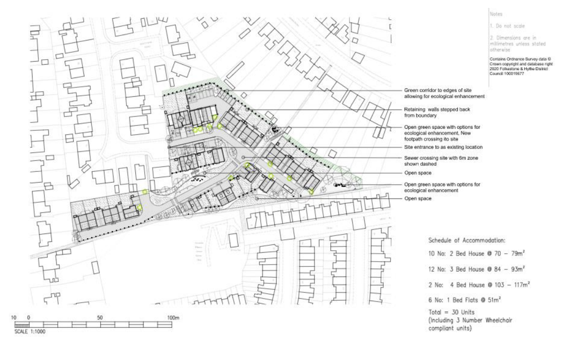
Figure 1 Site Layout