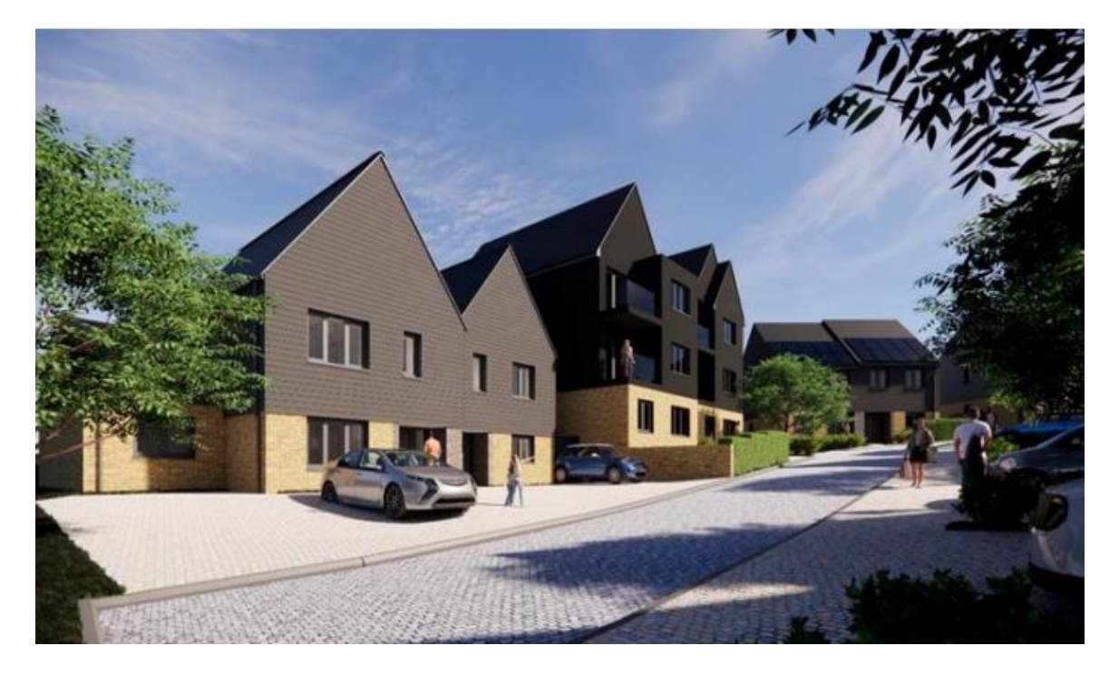
Figure 4 CGI street scene